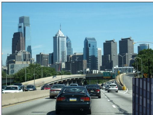
PHILADELPHIA What a fantastic skyline greeting us as we approached Downtown Philly! It was a beautiful last day for our couple of hours sightseeing. A 'must see' was of course